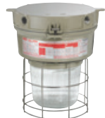
Ceiling w/ 7-3/4" Globe & Guard