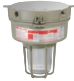
Ceiling w/ 5-1/2" Globe & Guard