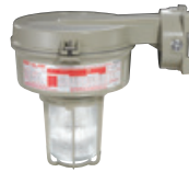
Wall w/ 5-1/2" Refractor & Guard