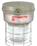
Pendant w/ 7-3/4" Globe & Guard